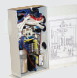
Standard remote mount electrical box with electrical diagram

Each FCF unit comes standard with a 4 or 5 inch ducting collar, high velocity 360 degree rotatable blower, remote mount electrical box, digital control with bezel, remote control, air filter, and reverse cycle heat.